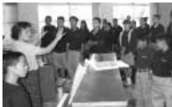
Preuss School students prepare for their first annual Winter Concert.