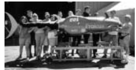
Conexant's gift supports student design projects such as the Human Powered Submarine

Conexant is the world's largest independent company focused exclusively on semiconductor products and systems solutions for communications electronics.